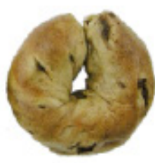
Poor Join (Sloped and/or side notched)