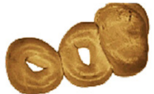
Double Triple (large surface area and hole count)

Only common examples have been pictured. There are many standard measurements that can be used, individually or combined within formulae, to qualify your product. All visible product characteristics and faults can be quantified.