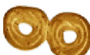
Kissed (join length and double surface area, separate and re-circulate)