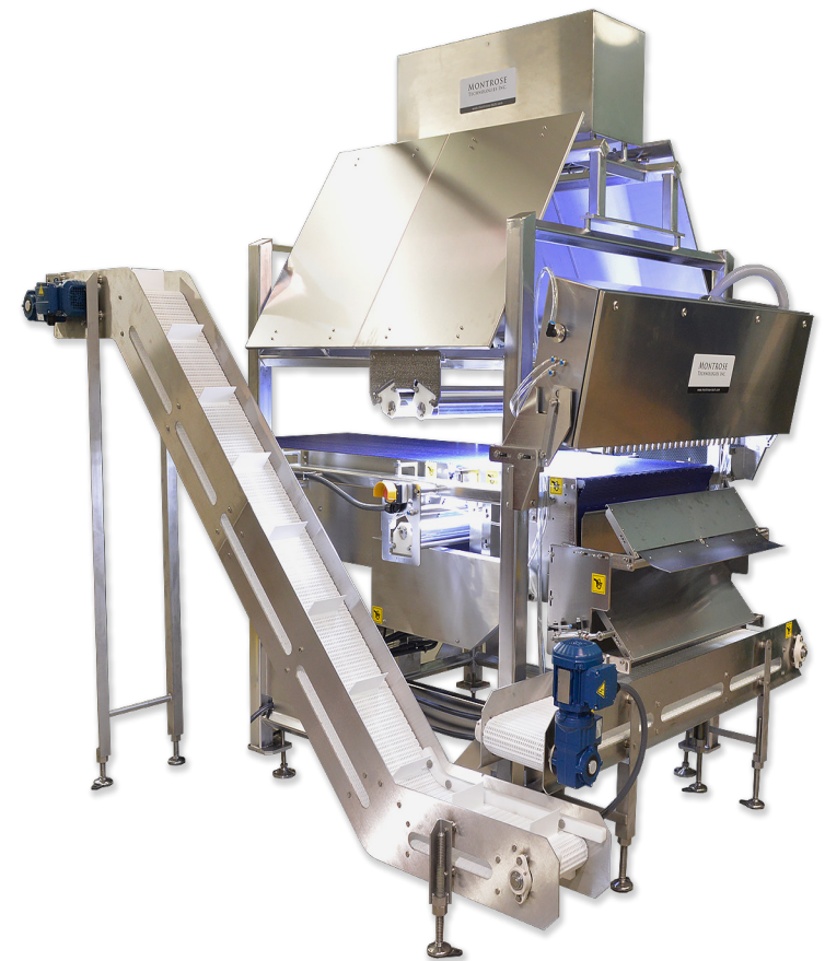
MT-36 In-line Inspection Systems for Bagels