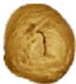
Too Large (large peak height, and/or volume)