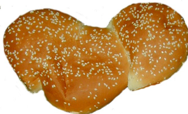
Double / Triple (large surface area)

Only common examples have been pictured. There are many standard measurements that can be used, individually or combined within formulae, to qualify your product. All visible product characteristics and faults can be quantified.