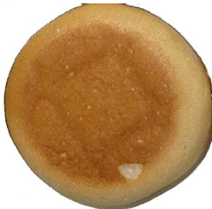
White Ring (light area near heel perimeter)