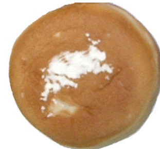
Heel Flour (very light heel area)