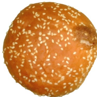
Blisters (dark surface area)