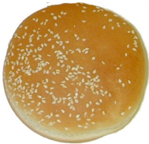
Seed Voids (regional low color deviation)