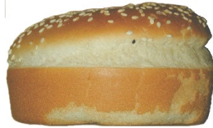
Misshaped Slope (poor height symmetry)