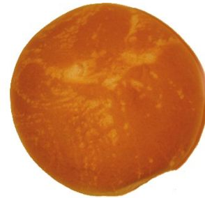
Blotchy (regional high color deviation)